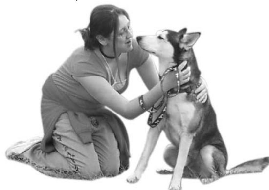
Microchips can help reunite owners with lost pets.

Adopting a dog or cat with a microchip already embedded is a big cost savings for the adoptive family. Chip insertion usually costs around $40 and registration of the ID number usually costs another $20. Microchips are not a replacement for ID tags and rabies tags. They do, however, offer the added peace of mind that a lost pet can be recovered. So, although the family in the opening story had to travel on without Buddy, they were contacted while still on vacation and told that Buddy had been found. They were reunited as they drove through the area where Buddy had been lost on their return trip home.