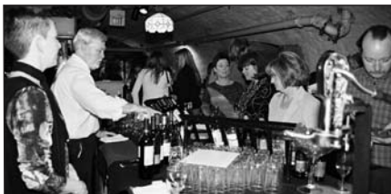
Guests were able to taste several different wines at last year's Paws to Party.

CHA Animal Shelter is hosting its 2nd Annual "Paws to Party" Wine Tasting Event at the Graystone Wine Cellar in downtown Columbus on Friday, February 16.