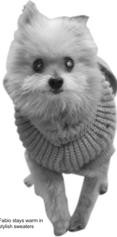
Fabio stays warm in stylish sweaters

The Emergency Medical fund is financed solely through donations. To give animals just like Fabio another chance at life, just specify that any contribution go directly to the Emergency Medical Fund.