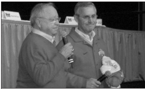
Former and current head football coaches Earle Bruce (left) and Jim Tressel.

The first annual Earle Bruce Beat Michigan Tailgate fundraiser, held the day before the November 18 OSU-Michigan game, was as much of a success for CHA as that game itself was for the Buckeyes.