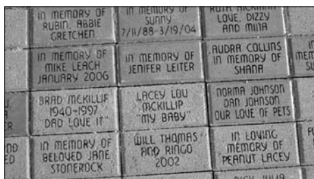
More than 1,000 commemorative bricks are still available.

If you've visited our shelter, you're bound to have noticed the many commemorative bricks that are part of the walkway leading to the front door. If you want to remember someone special, a pet or a fellow pet-lover, you may purchase a brick to place